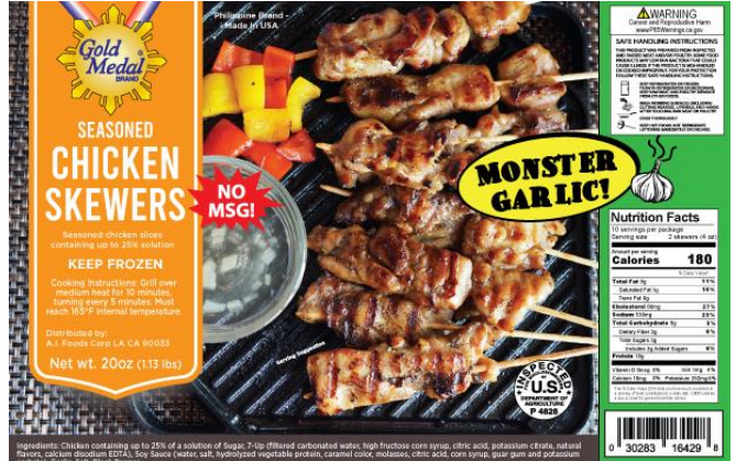
GOLD MEDAL CHICKEN SKEWERS GARLIC 24/20oz, ITEM ID: 9000-091, UPC # 0 30283 16429 8