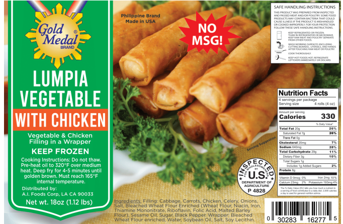
GOLD MEDAL LUMPIA VEGETABLE WITH CHICKEN 12/18oz, ITEM ID: 3310-A, UPC # 0 30283 16277 5