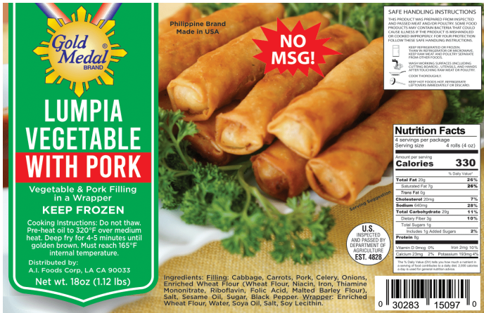
GOLD MEDAL LUMPIA VEGETABLE WITH PORK 12/18oz, ITEM ID: 3312-A, UPC # 0 30283 15097 0