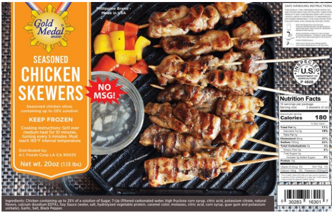
GOLD MEDAL CHICKEN SKEWERS 24/20oz, ITEM ID: 3142, UPC # 0 30283 16301 7