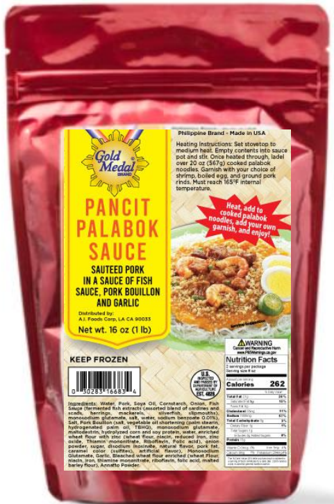
GOLD MEDAL PANCIT PALABOK SAUCE 16/16oz ITEM ID: 9000-248 UPC # 0 30283 16683 4