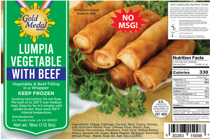
GOLD MEDAL LUMPIA VEGETABLE WITH BEEF 12/18oz, ITEM ID: 3311-A, UPC # 0 30283 15098 7