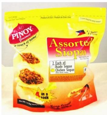
PINOY GOURMET ASSORTED SIOPAO (Mix of Steamed pork & chicken buns) 12/16oz, ITEM ID: 9000-098 UPC # 0 30283 16455 7