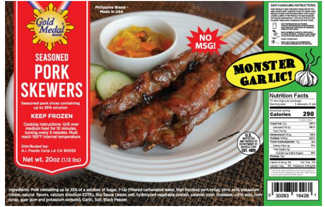
GOLD MEDAL PORK SKEWERS GARLIC 24/20z, ITEM ID: 9000-090UPC # 0 30283 16428 1