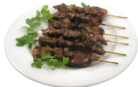
GOLD MEDAL BEEF SKEWERS 24/12oz, ITEM ID: 3134-G, UPC # 0 30283 16700 8