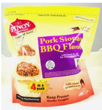
PINOY GOURMET PORK SIOPAO BBQ (Steamed pork bun-barbecue flavor) 12/16oz, ITEM ID: 3247-B UPC # 0 30283 16395 6