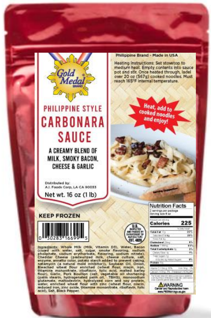
GOLD MEDAL PHILIPPINE STYLE CARBONARA SAUCE 16/16oz ITEM ID: 9000-248 B UPC # 0 30283 16695 5