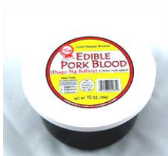
GOLD MEDAL PORK BLOOD 24/10oz ITEM ID: 3403-A UPC # 0 30283 15080 2