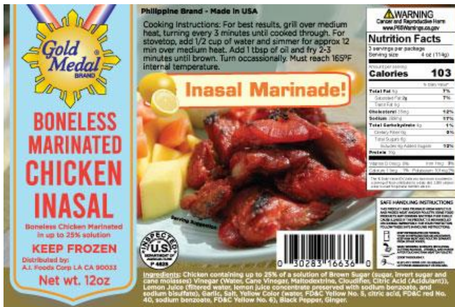
GOLD MEDAL BONELESS CHICKEN INASAL 30/12oz, ITEM ID: 3183, UPC # 0 30283 16636 0