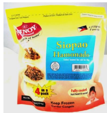
PINOY GOURMET PORK SIOPAO HAMONADO (Steamed pork sausage bun) 12/16oz, ITEM ID: 3261 UPC # 0 30283 16057 3