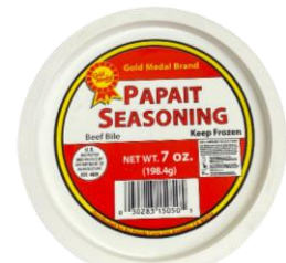
GOLD MEDAL BEEF BILE 32/7oz ITEM ID: 3401 UPC # 0 30283 15050 5