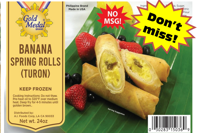
GOLD MEDAL BANANA SPRING ROLLS (TURON) 12/24oz, ITEM ID: 3301, UPC # 0 30283 15036 9