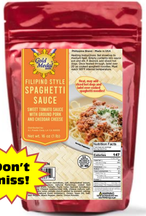
GOLD MEDAL FILIPINO STYLE SPAGHETTI SAUCE 16/16oz ITEM ID: 9000-248 A UPC # 0 30283 16691 9