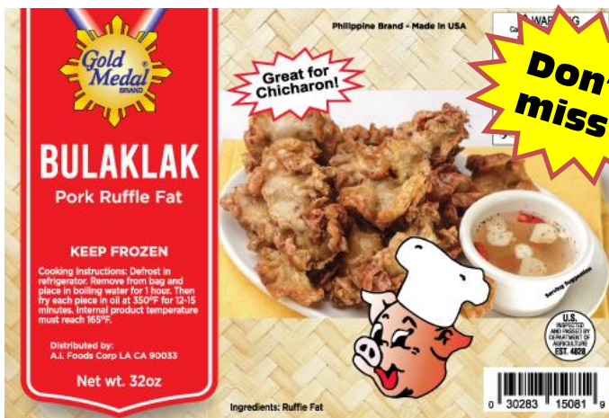
GOLD MEDAL RUFFLE FAT 16/32oz, ITEM ID: 3117, UPC # 0 30283 15081 9