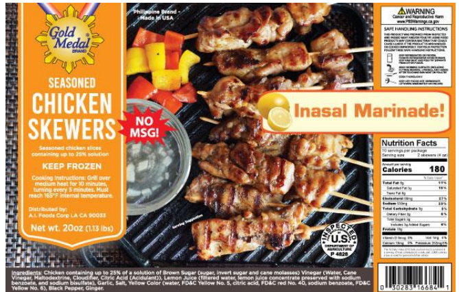
GOLD MEDAL CHICKEN SKEWERS INASAL 24/20oz, ITEM ID: 3181, UPC # 0 30283