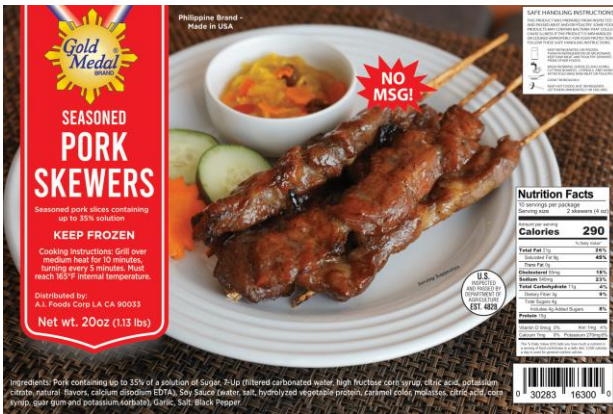
GOLD MEDAL PORK SKEWERS 24/20z, ITEM ID: 3141, UPC # 0 30283 16300 0