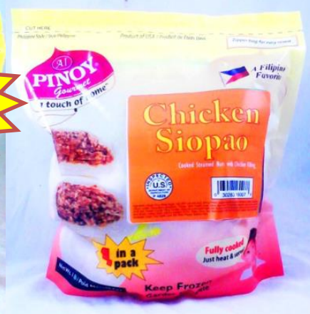
PINOY GOURMET CHICKEN SIOPAO (Steamed chicken bun) 12/16oz, ITEM ID: 3254 UPC # 0 30283 16007 8