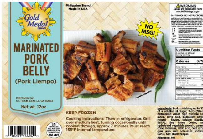
GOLD MEDAL MARINATED LIEMPO 30/12oz, ITEM ID: 3710, UPC # 0 30283 16694 0