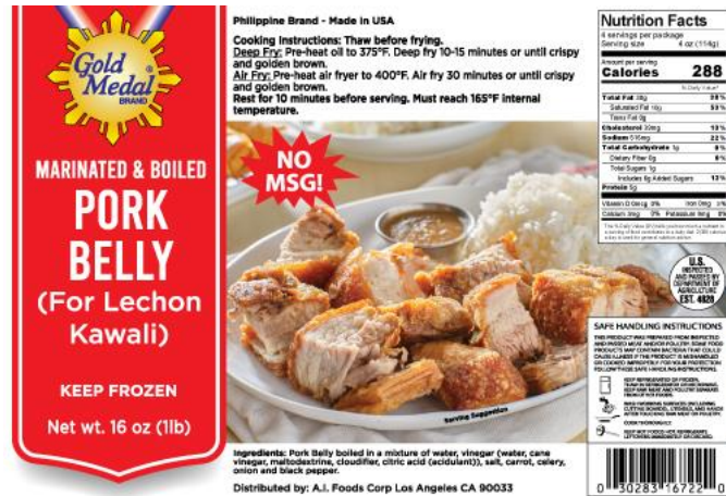
GOLD MEDAL LECHON KAWALI 24/16oz, ITEM ID: 3716, UPC # 0 30283 16722 0