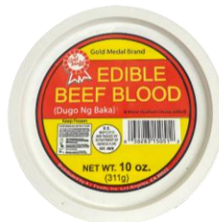
GOLD MEDAL BEEF BLOOD 24/10oz ITEM ID: 3402-A UPC # 0 30283 15051 2