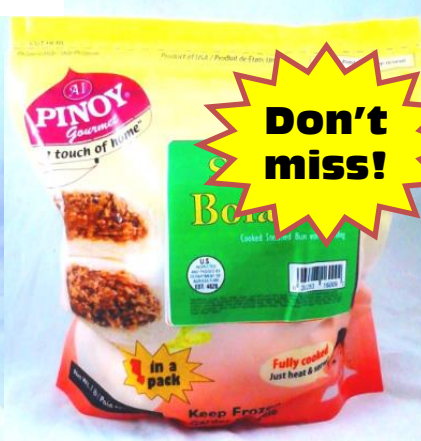
PINOY GOURMET SIOPAO BOLA-BOLA (Steamed bun with pork dumplings) 12/16oz, ITEM ID: 3256 UPC # 0 30283 16009 2