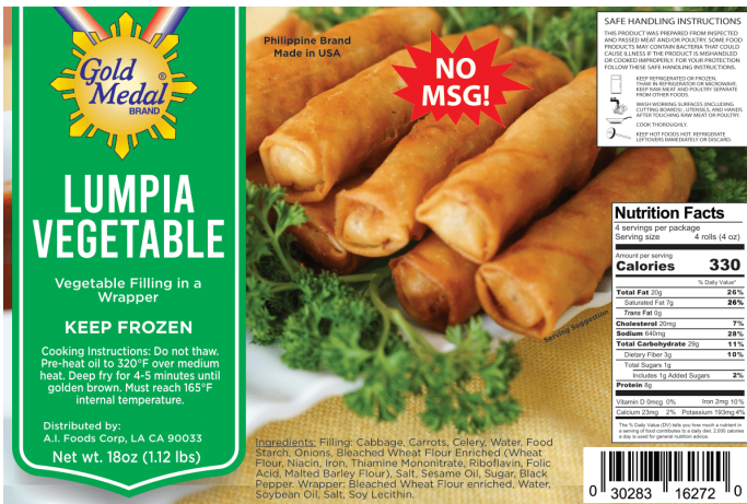
GOLD MEDAL LUMPIA VEGETABLE PLAIN 12/18oz, ITEM ID: 3314-A, UPC # 0 30283 16272