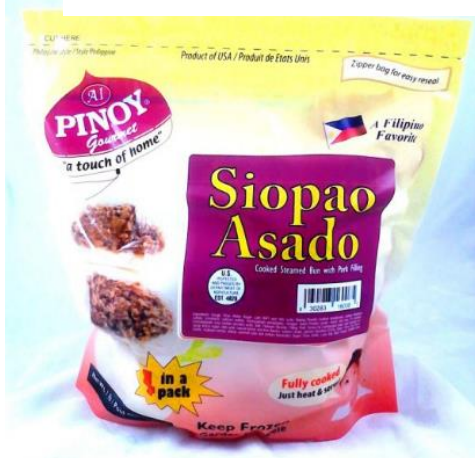
PINOY GOURMET PORK SIOPAO ASADO (Steam pork bun) 12/16oz, ITEM ID: 3247 UPC # 0 30283 16008 5