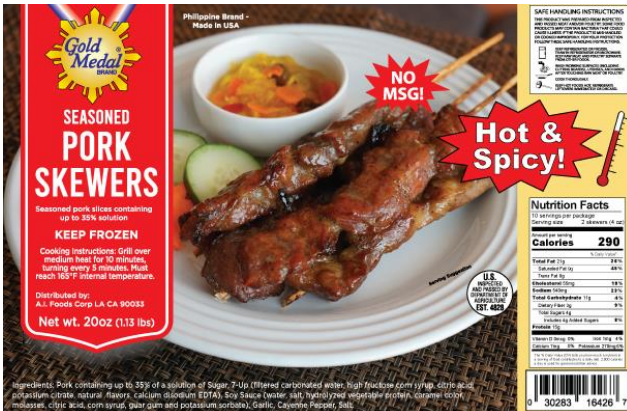
GOLD MEDAL PORK SKEWERS HOT & SPICY 24/20z ITEM ID: 9000-088 UPC # 0 30283 16426 7

Also available: GOLD MEDAL PORK SKEWERS LARGE BULK 100 skewers, 3.2 oz each ITEM ID: 3134 UPC # 0 30283 16297 3