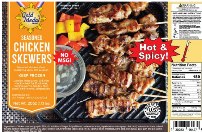
GOLD MEDAL CHICKEN SKEWERS HOT & SPICY 24/20oz, ITEM ID: 9000-089, UPC # 0 30283 16427 4