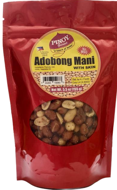
PINOY GOURMET PEANUTS (WITH SKIN) 24/5.5oz ITEM ID: 3201 UPC # 0 30283 15083 3